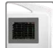
12-lead Waveforms Display