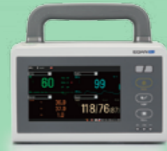
iM20 Patient Monitor