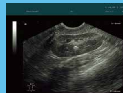
Canine Renal Stone