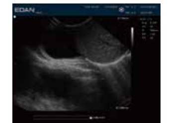
Feline Subhepatic effusion