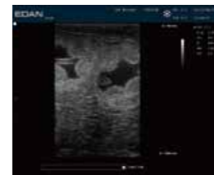
Canine Intestinal Canal