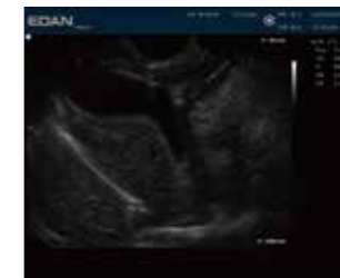
Canine Gall Bladder