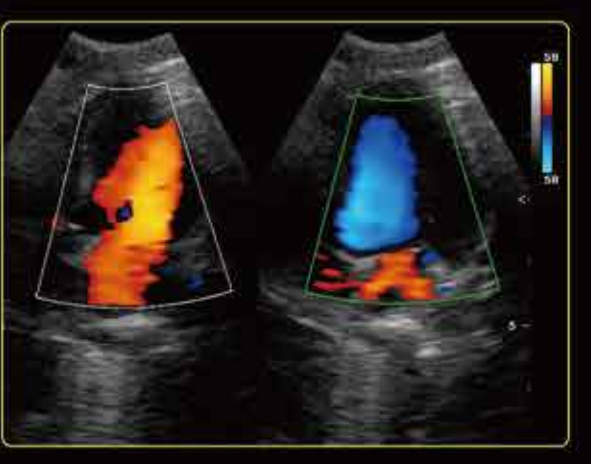
Canine Cardiac Blood Flow

The U60 provides excellent detail, contrast resolution and image uniformity without sacrificing penetration. Excellent color and Doppler sensitivity easily detects small, low flow vessels.