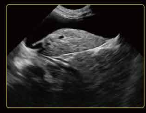
Canine Foldable Gallbladder