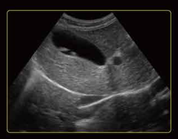
Canine Gallbladder Polyps